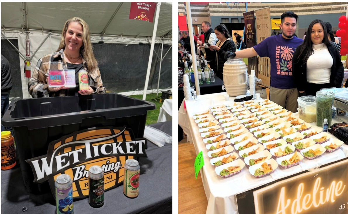
Figure 9: Two Rahway businesses who participated in the 2025 Taste of Spring: Wet Ticket Brewing and Adeline Deli

This is a well-loved annual event held each spring inside the Recreation Center. In 2025, 31 restaurants participated. Twenty-six restaurants were from Rahway and 5 from the local area. Additionally, 5 local breweries participated in the beer garden including Wet Ticket Brewing. Attendance at this sold-out event is typically between 850-1000 people.