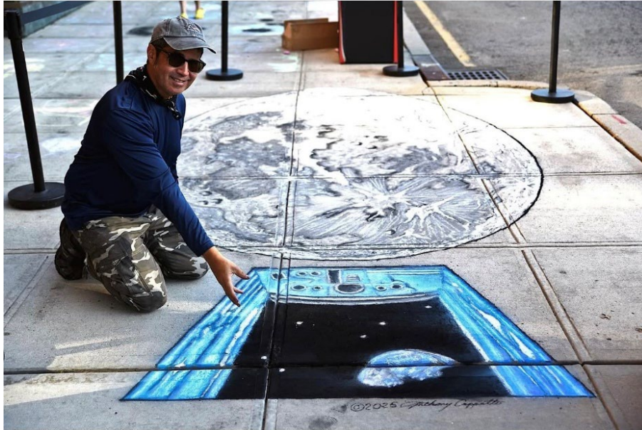
Figure 14: The chalk artist poses with his completed sidewalk drawing at Arts Fest

décor, clothing and accessories showcasing the diversity of creativity at home in Rahway. This event typically draws 500-750 attendees to Irving Street from Rahway and surrounding towns.