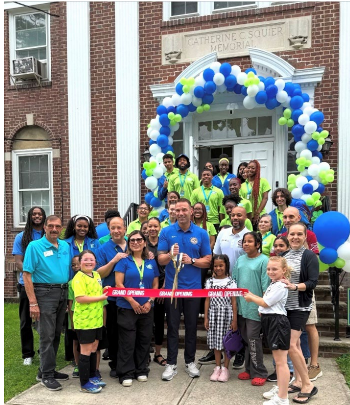
Figure 5: Ribbon cutting ceremony at Rahway's Best After School Program & Summer Camp