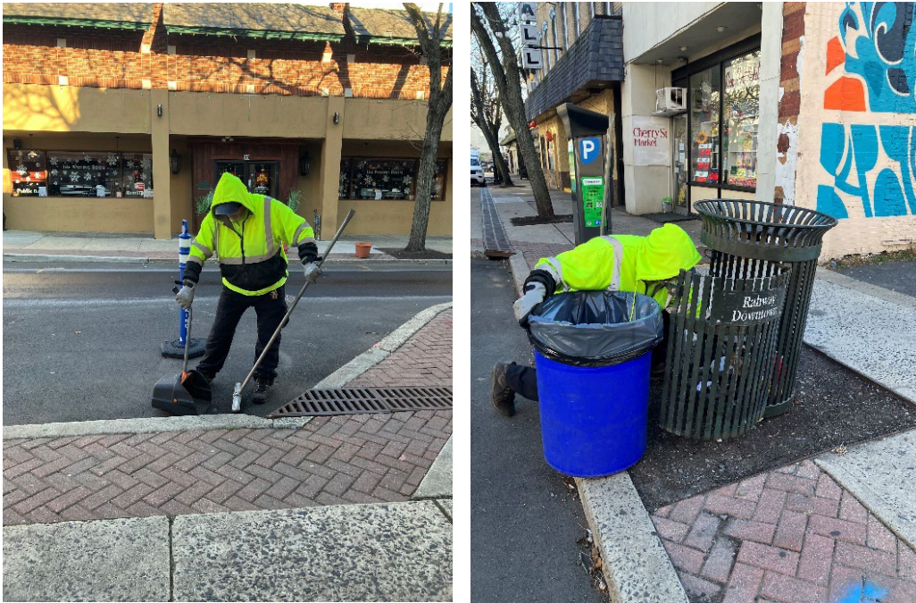
Figure 1: SID maintenance workers sweep litter and change liners in garbage cans on E. Cherry Street.