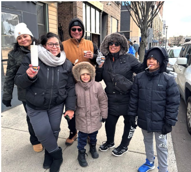
Figure 8: Soup Stroll attendees pose with their cups

Rahway SID presents or sponsors numerous events throughout the year, some of which are marketing events and initiatives designed to spotlight retail businesses, local restaurants and eateries. These marketing events include Soup Stroll, Taste of Spring, No Sin Mi Bocadillo and the 'Shop Rahway, Support Local' initiative.