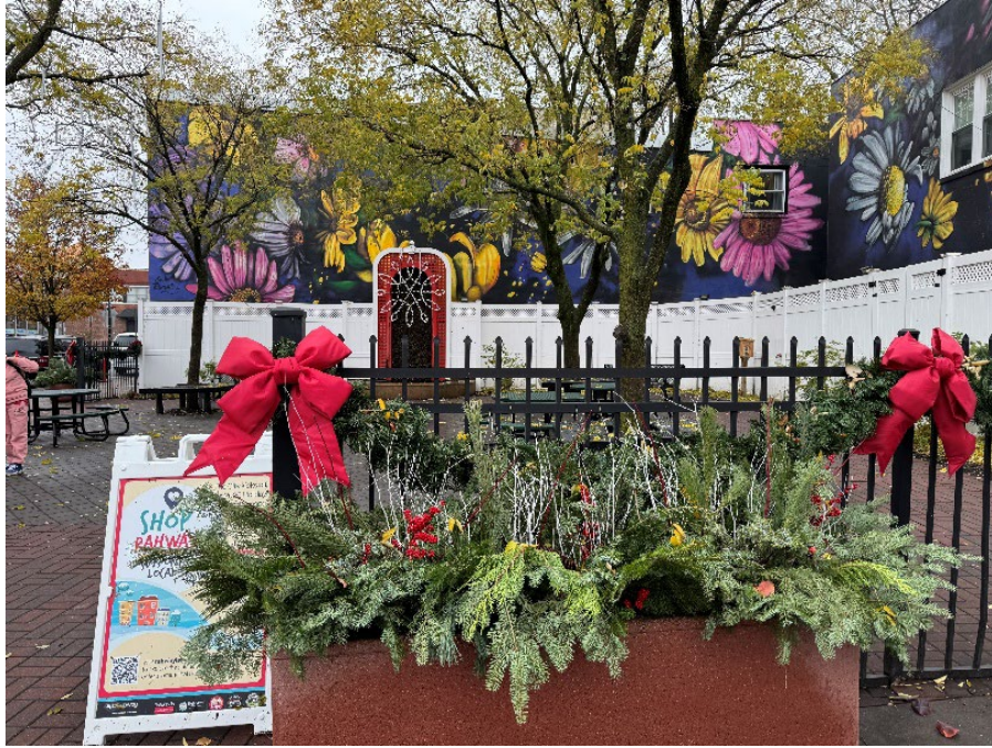
Figure 2: Winter greenery and holiday decorations in Rahway Arts District Park