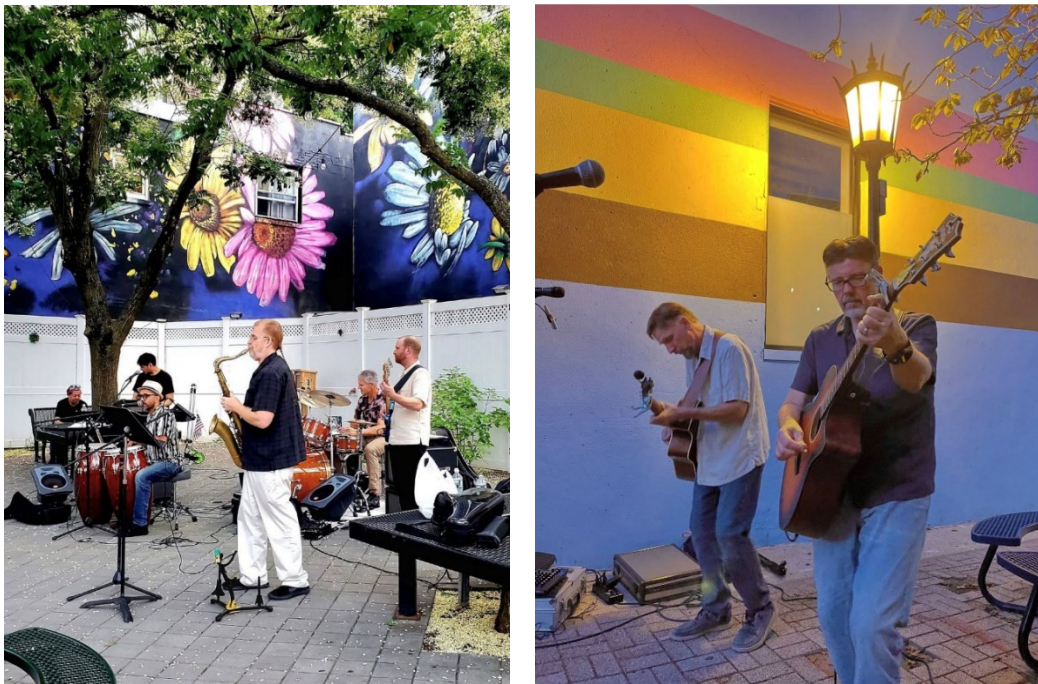
Figure 13: Music all summer long in Rahway Arts District Park and the Paseo

Performances held in Rahway Arts District Park, the Paseo, on Cherry Street, and in the Train Station Plaza bring the community out into these public spaces. Residents may bring their lawn chairs, purchase takeout at neighborhood restaurants, and let their children play outdoors while enjoying these free concerts. The music series features a range of musical styles, genres, and performers.