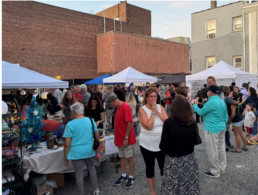
Figure 16: Moonlit Market attendees browse and buy from vendors selling their unique and artistic wares