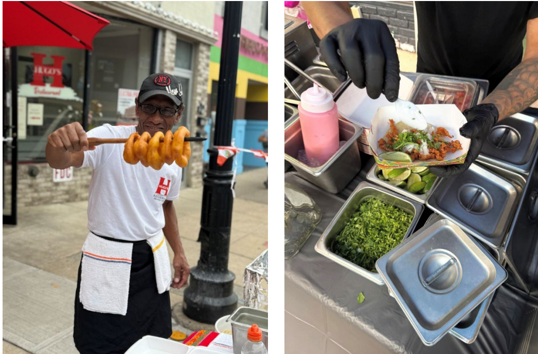
Figure 10: Hugo's Peruvian Restaurant and La Chula sold delicious bites during No Sin Mi Bocadillo