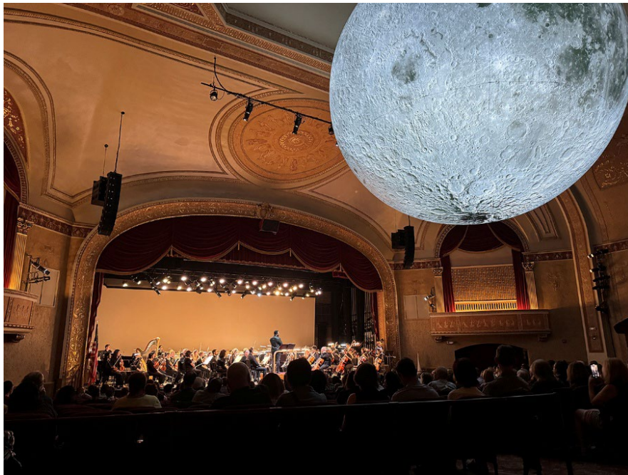
Figure 15: Museum of the Moon hangs overhead as NJ Symphony performs onstage at UCPAC during Festival of the Moon

Special events included a concert by the New Jersey Symphony, dance performances by American Repertory Ballet and Chinese Culture Arts Association, as well as theatrical performances by TheaterWorksUSA and New Jersey Opera. Attendees visited from Rahway, Linden, Clark, as well as other communities in Union County and Middlesex County.