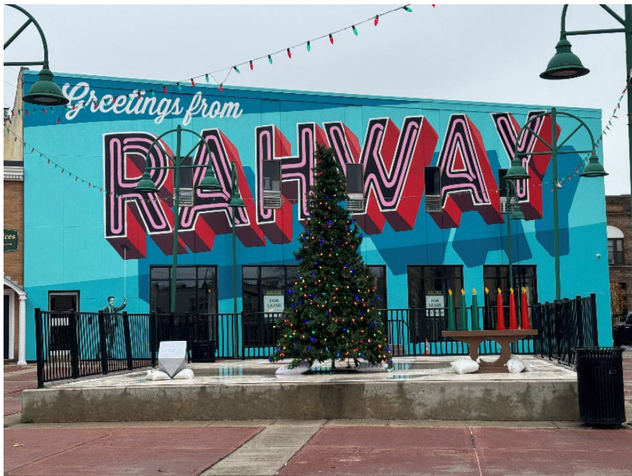
Figure 3: Holiday decor at the Train Station Plaza