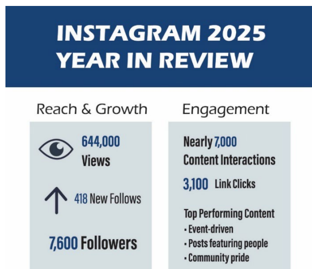
Figure 7: Rahway Is Happening Instagram's 2025 engagement statistics