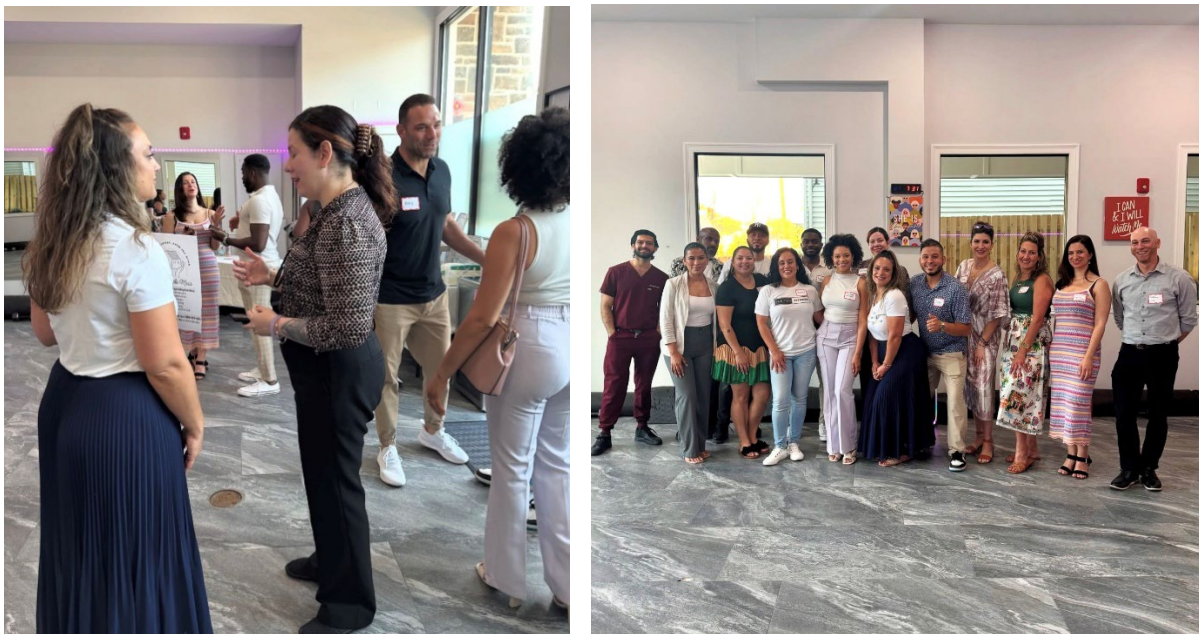
Figure 12: Business owners enjoyed networking at a SID gathering

Rahway SID also hosted several networking events for business owners, including one for Women in Business, a general SID business event, a networking meeting for Hispanic and Latino business owners, and one for restaurant operators.