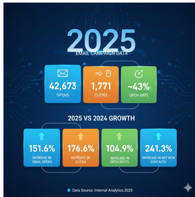
Figure 6: Statistics from Rahway is Happening's 2025 email marketing campaigns